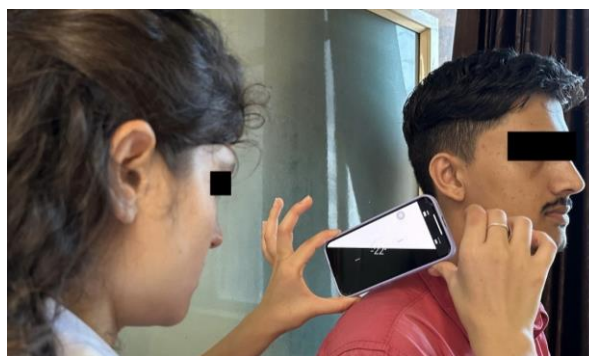
Fig 1: Use of smartphone application to measure posture (CV angle)

CV angle was assessed by using the iPhone inclinometer. Here subject has to be in sitting position with head normal position then the angle is measured between the seventh cervical spinous process and tragus of ear. The accuracy of the iPhone inclinometer in measuring cervical mobility and head orientation seems to be high. All of the variables had great inter- and intra-tester reliability ( ICC > 0.81 ) 17 . A more forward head position is indicated by a lower craniovertebral angle (CVA). A CVA less than 48-50 are defined as Forward head posture.