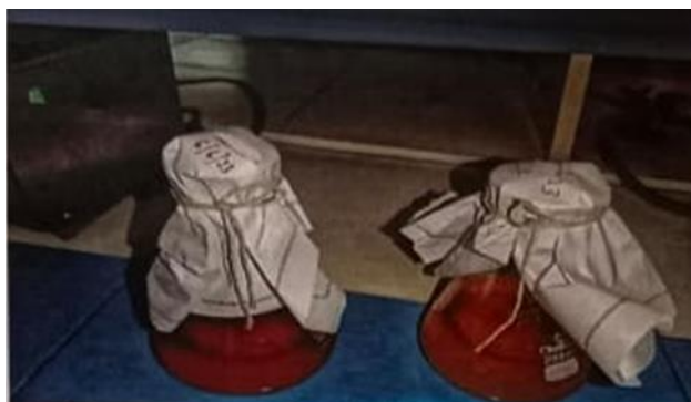
Fig. No 1: Preparation of culture media

Agar cup plate method was used for screening of antimicrobial activity of melaleuca alternifolia Oil gel. All formulations of melaleuca alternifolia Oil gel of about 2% were placed aseptically in cups of agar plate which was previously inoculated with the culture. The plates were left at ambient temperature for 30 mins before to incubation at 37°C for 24 hrs. The broad-spectrum antibiotic i.e., Doxycycline was used as a positive control for obtaining comparative results. Plates were observed after 24-48 hrs incubation for the appearance of the zone of inhibition