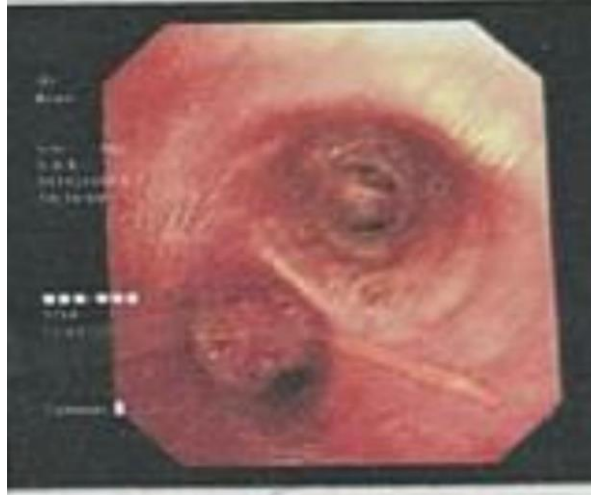
Fig-3 Endoscopic appearance of carcinoid tumour