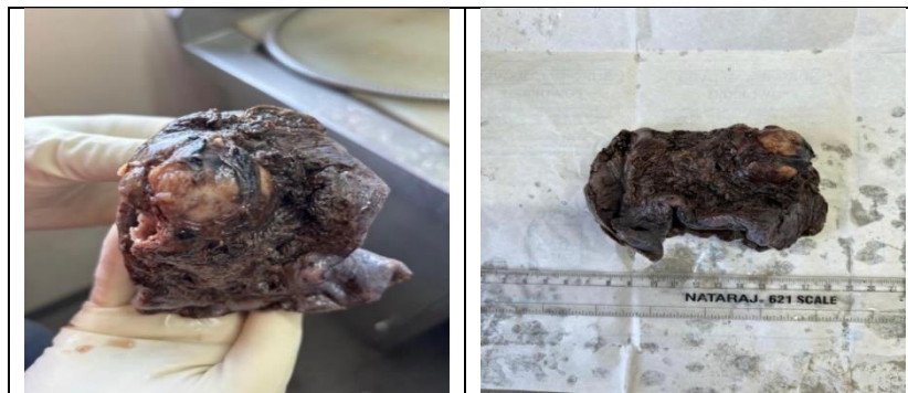
fig-1 Left lower lobectomy piece.

Histopathological study of the excised mass showed lower left lobectomy specimen measuring 11x7x3 cm. External surface is congested. On cut section, a grey-white firm nodule is identified measuring 3.5x3x2.3 cm in lower pole. Multiple cystic spaces were identified largest measuring 0.3 cm in the greatest dimension. Microsections examined showed lung tissue and mucosal glands with foci of inflammatory infiltrate. Sections examined from grey white firm nodule show histological features suggestive of typical carcinoid tumour; well-differentiated. Showing, uniform tumour cells with polygonal shape, round to oval nuclei with salt and pepper chromatin, inconspicuous nucleoli, moderate to abundant eosinophilic cytoplasm. One lymph node isolated from the hilum of the lobectomy specimen showed reactive lymphadenitis. Sections examined from the excised margins were free from tumor infiltration. For further confirmation. a panel of immunohistochemical markers were applied. The tumor cells showed positive cytoplasmic immunoreactivity for CK, CD56, Synaptophysin and chromogranin while negative immunostaining for TTF-1, napsin and CDX2.