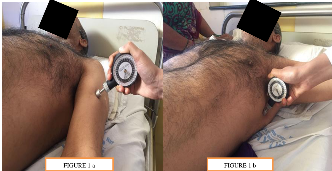
FIGURE 1 a Fig 1 a – PPT of Deltoid muscle using pressure algometer FIGURE 1 b Fig 1 b – PPT of subscapularis muscle using pressure algometer