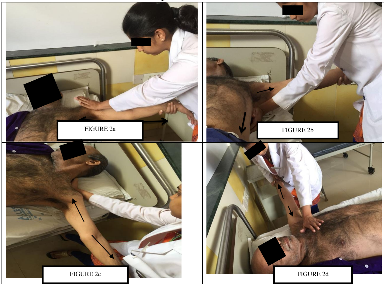
FIGURE 2a Fig 2a – Arm pull + Focused MFR to Deltoid muscle. FIGURE 2b Figs 2b – Arm pull + Focused MFR to subscapularis muscle FIGURE 2c Figs 2c – Arm pull + Focused MFR to trapezius muscle FIGURE 2d Figs 2d- Arm pull + Focused MFR to pectoralis muscle