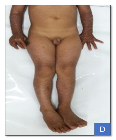
Figure 1. (a-d) Hyperpigmented macules, multiple lentigenes at sun exposure areas and necrotic abscess in left periorbita.