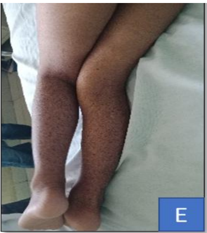
Figure 3.(A-E) after 30th day of treatment, Hyperpigmented macules, multiple lentigenes at sun exposure are still existed

Based on the history taking, physical examination, and supporting examination, a diagnosis of XP with SCC of the eye was eventually made. The patient was given education on sun protection measures and SPF 30 sunscreen. The patient is advised to do a regular monthly control to our department.