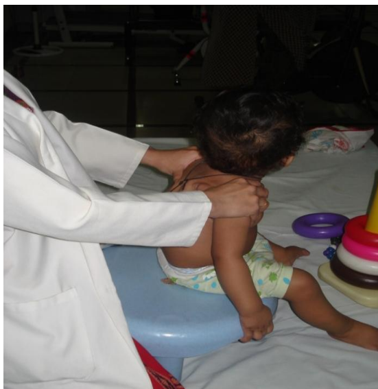
Picture 3: Pectoral Elongation with Vertebral Compression without Tape