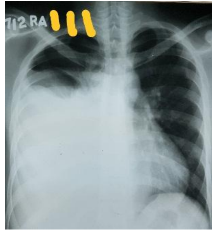
Figure 3 Right sided empyema