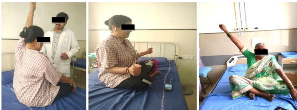
Shoulder exercises and hand pumps along with music therapy

Dosage: Each exercise was performed for 5 repetitions, with 1 minute rest and 10 minutes regime.