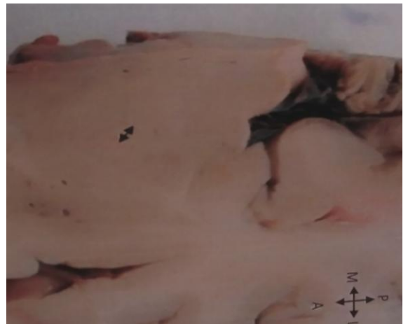
Figure 2: Transverse section 4mm ventral to plane of mid-commissural point showing width of the subthalamic nucleus

Transverse section of the brain was made at a plane 4mm ventral to the plane containing mid commissural point. [5] The brain specimens were categorized into 3 age groups, Group A: 20-35 years, Group B: 35-50 years and Group C: above 50 years. The dimensions of the subthalamic nucleus were measured bilaterally. The maximum dimension along the longitudinal and transverse axis of the biconvex subthalamic