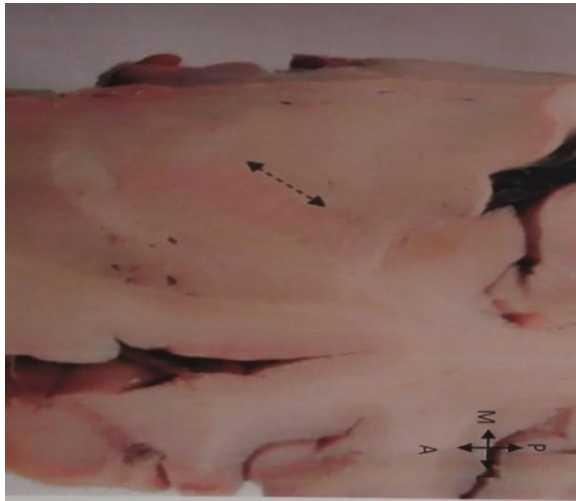
Figure 3: Transverse section 4mm ventral to plane of Mid commissural point showing length of the subthalamic nucleus

nucleus (Figure 2,3) was measured with aid of digital Vernier caliper and magnifying glass.