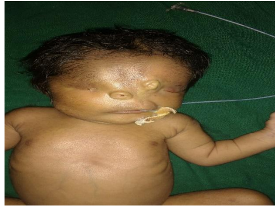
Figure 2 = Absent eyes and deformity of nose showing rudimentary and blind ending nostril

Both orbits were shallow, small with maldeveloped eyeballs (Right > Left) along with hypertelorism. The brain parenchyma was normal.