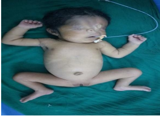
Figure 1 = Neonate

sinuses were not visualized. There was a defect of size 1.1 cm * 7 mm in frontal bone in left paramedian position with exophytic soft tissue of size 9.2 * 8.6 mm at level of defect suspecting maldeveloped left nasal placode.