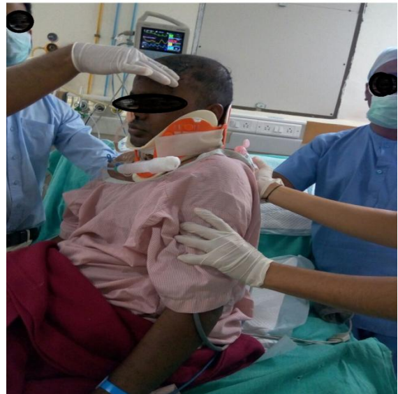
Fig.2 Mobilised to sitting position and patient is on ventilator support