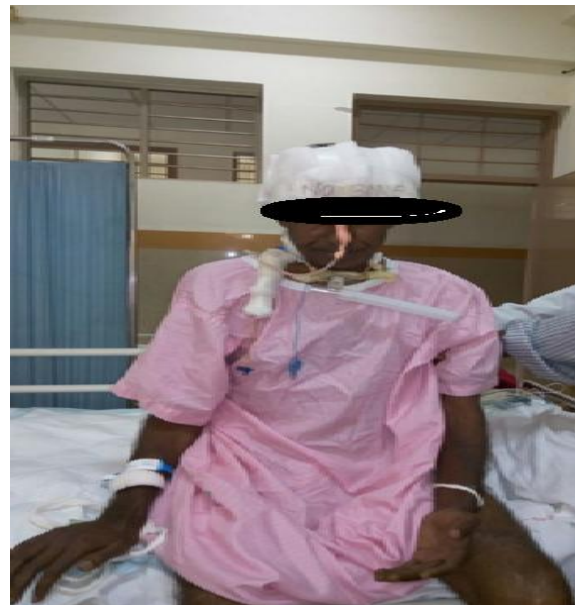
Fig.3 Patient able to sit by himself with very minimal support