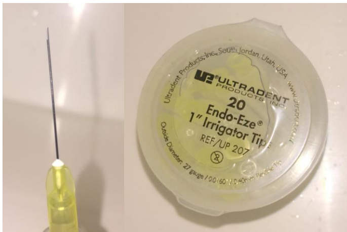
Side vented apertura lateral

The data were tabulated and statistically analyzed using SPSS version 24 the comparison between the means was tested using t-test one-way ANOVA test and the percentage using Chi-Square test. The level of significance was set at 0.05.