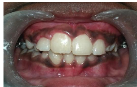
Fig.8: Maxillary central incisor is in normal alignment in the arch.