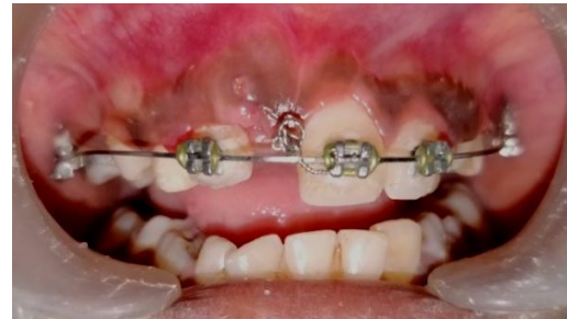
Fig.6: Initiation of extrusive force over impacted tooth by tightening the ligature wire.