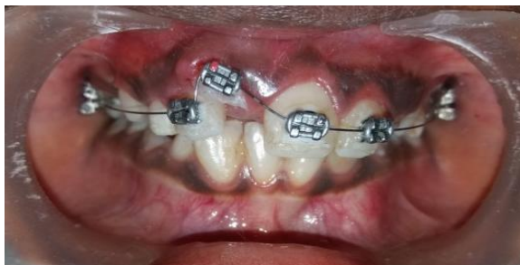
Fig.7: Bonding of bracket as the impacted tooth is visible followed by fix appliance therapy.