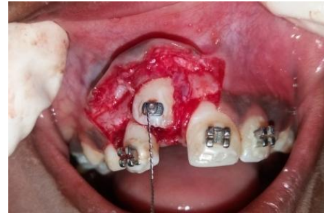
Fig.4: Surgical exposure of crown followed by bonding of orthodontic button and ligature wire.