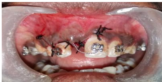
Fig.5: Full flap closure in its previous position and outer portion of ligature wire is kept passively.