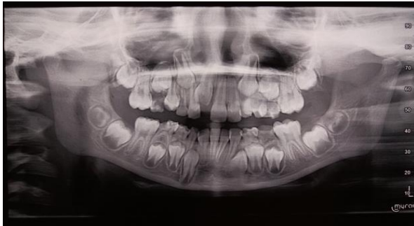
Fig.3: Panoramic radiograph showing ectopically present maxillary right central incisor.