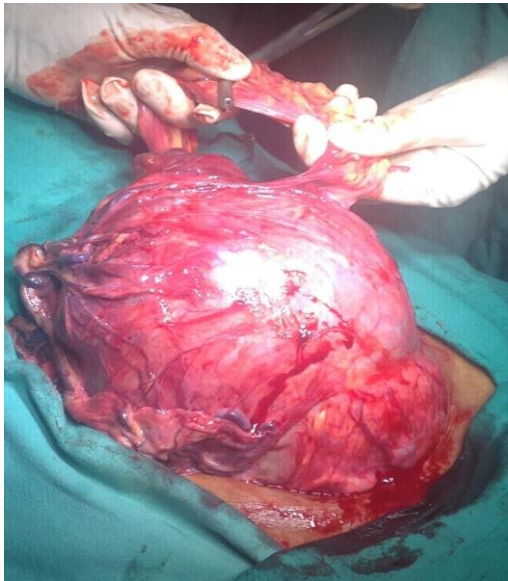
Mass of 16*13 cm attached to uterus on right cornua

13x5cm, globular, outer surface smooth and encapsulated. Uterus and cervix with one sided adnexa measuring 9x3x1.5 cm .Right sided ovary measures 3x2cm fallopian tube measure 7x1.2cm. The HPE report revealed tumour mass composed of immature neural element in form of cellular glial tissue and neuroepithelial rosettes. IMPRESSION: Tumour mass - Immature teratoma ,ovary - multiple follicular cyst, corpus albican, uterus was normal.