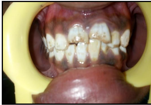
Fig. 1. Preoperative view

examination revealed an immature tooth with a wide open apex and a radiolucent area in proximity of the apex of the tooth (Fig.2). Thermal test, Electric pulp tests revealed abnormal response and non tender on percussion. The fracture involves the pulp chamber through the incisal edge.