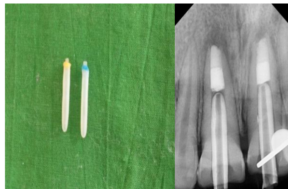
Fig.8 Modification of Fiber post with composite