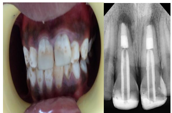
Fig.10 Clinical photograph of completed core restoration