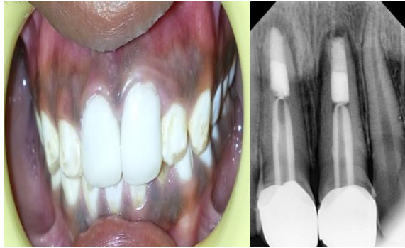
Fig.12 Cementation of Zirconium Crown