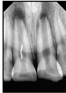
Fig. 2. Preoperative radiograph