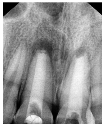
Fig. 4 Calcium Hydroxide dressing