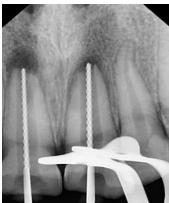
Fig. 3 Working length determination

canal disinfection prior to MTA placement, canal was dried with paper points), calcium hydroxide was placed (Fig.4), and the access was closed with a sterile cotton pellet followed by a provisional restorative material IRM. The patient was then reappointed for continuation of treatment approximately 1 week from the initial appointment.