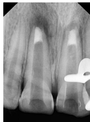
Fig. 5 MTA Plug of 4 mm

At the next appointment, rubber dam was placed as described above. The tooth was re-accessed, and calcium hydroxide was removed with 3% NaOCl irrigation and instrumentation. Before obturation, the canal was irrigated with 3% NaOCl and saline and the canal was then dried with