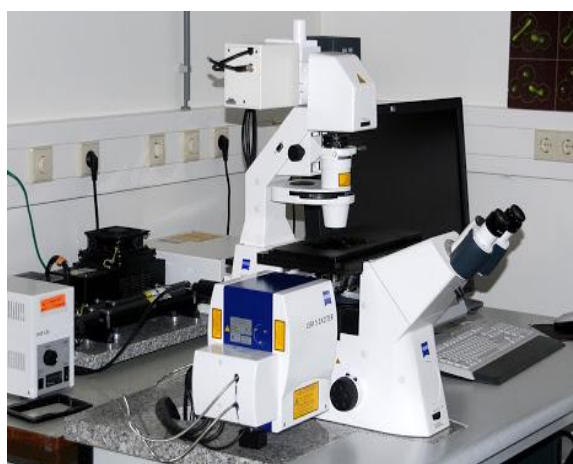
Fig.4 Confocal laser electron microscope

The degree of dye penetration in both enamel and dentinal walls of each specimen was assessed under a confocal laser scanning microscope (Olympus Lext OLS4100, Germany) [Fig.4] at 5x magnification. That half of the each sample with no damage was used to study under the confocal laser scanning microscope.