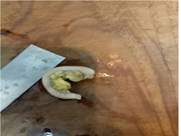
Figure-2 chronic appendicitis