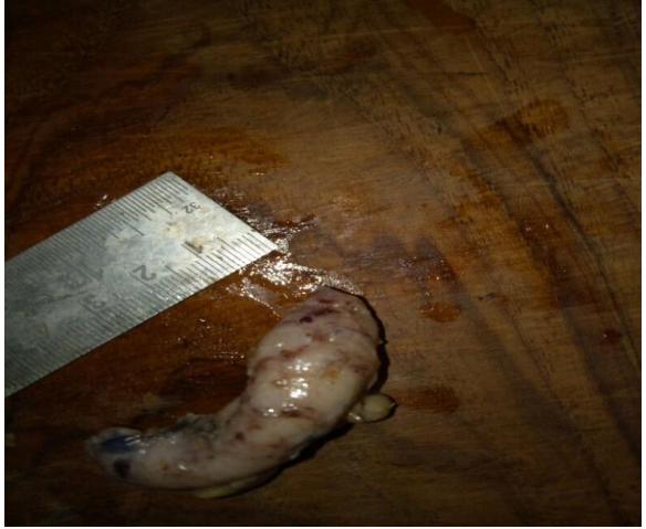
Figure-1 acute appendicitis

In our study 33cases showed the grade- I count and 22 cases showed the grade- II count. There was a marked decrease in the mast cell count in the grouplesions progressive А due to a degranulation, thus making it difficult to detect the mast cells. In the group-B lesions (11 cases), the mast cell count was of grades II and III and in the group-D lesions (84cases), the maximum number of mast cells were observed to be in grade III. The mucosal mast cell count was marginally more than that which was found in the sub mucosa. (table-2, 3)