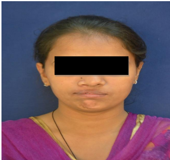
Figure-2 pre-operative image

which was inserted into the depth of the vestibule and incisions were placed on the upper of the frenum, the fibres inside mucosal surface were freed from bone attachments with the help of periosteal elevator. Surgical area was thoroughly irrigated with normal saline. The edges of the incised mucosa were sutured by using 4-0 vicryl with periosteum in form of interrupted sutures & periodontal pack (COE pack) was given to cover the exposed wound surface. Analgesic and antibiotics were prescribed. After 1 week sutures removed, healing was uneventful and no post-operative complications were noticed.