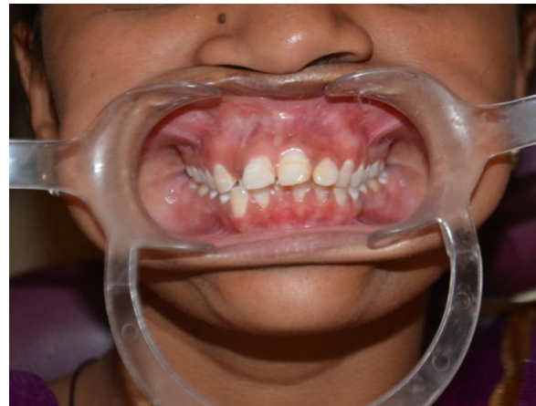
Figure-4 post operative image of treated aberrant frenum