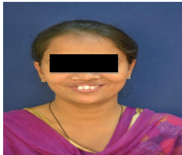
Figure-5 post operative image after 2 month of follow up