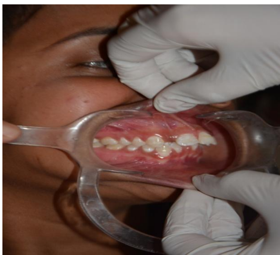
Figure-3 MLLF (median lateral labial frenum)