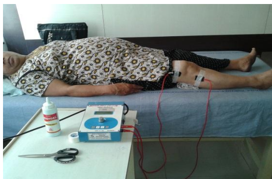
Figure 1: method of application of TENS

TENS: Conventional 2 pole TENS with frequency of 100 Hz was given for 15-20 minutes for 3 days from day 1. (11) Patients were treated in supine position with roll under their affected knee.