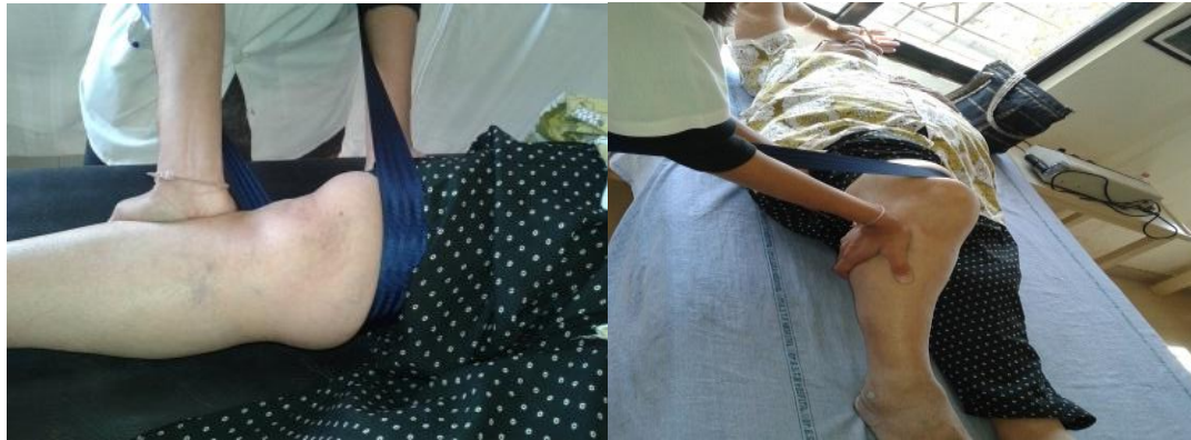
Figure 2: Application of medial glide starting position and movement for knee flexion

pain (medial glide with medial knee pain and lateral glide with lateral knee pain).