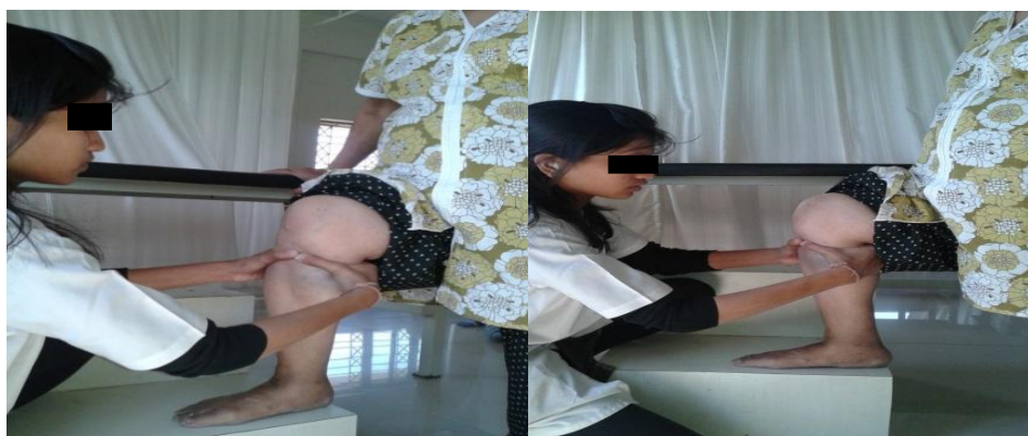
Figure 4: Application of rotation MWM for knee flexion in weight bearing position

was given as medial or lateral glide did not relieve patient’s pain in weight bearing position).