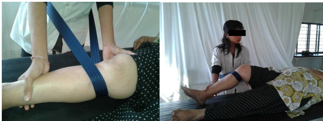
Figure 3: Application of lateral glide starting position and movement for knee flexion

The second mobilization technique was the “rotation” MWM: for patients with knee pain in weight bearing position rotation MWM was given. (Rotation MWM