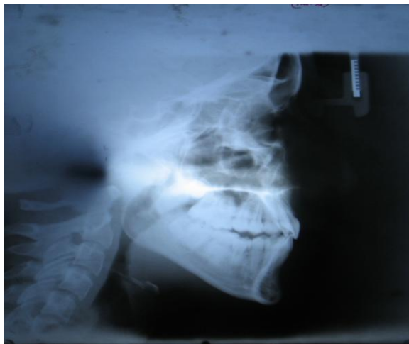
Fig 2 Pre-treatment radiograph.