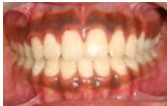
Fig 4 Post-treatment photograph.

This case was treated with pre-adjusted appliance [MBT, .022 slot]. Mandibular right central incisor was extracted. After alignment and leveling, Class III elastics were applied to L-shaped loops in .018"SS arch wire to close lower anterior space [Figure 3]. Final finishing was done using .019x025" SS archwires. After 18 months of active treatment, case was debonded and patient was given Hawley's retainer in maxillary arch and fixed retainer for mandibular arch.