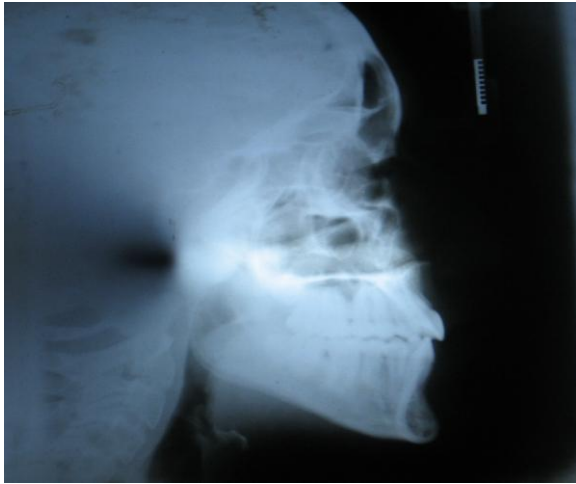
Fig 5 Post-treatment radiograph.