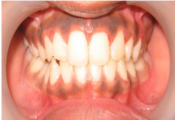
Fig 1 Pre-treatment photograph.