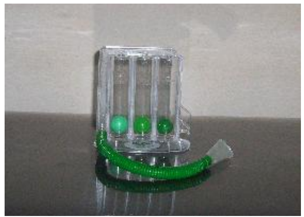
Fig (3)Incentive Spirometry device",

tightly around it. The patient was ordered to breathe in slowly and as deeply as possible, raising the balls toward the top of the column then hold his/her breath as long as possible (for at least five seconds), then allow the balls to fall to the bottom of the column. The exercise was performed for 10 minutes three times/week for 8 weeks.<sup>[28]</sup>