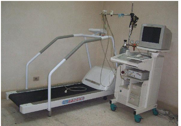
Fig. (2) Zan-680 Ergospiro "Ergospirometry System",

Spirometry means measuring of breath. It is used to measure lung functions, specifically the measurement of the amount of volume and flow of air that can be inspired and exhaled. The spirometry test was performed using a device called Ergospirometry device Fig (2). Spirometer devise displays two graphs called spirograms, a volume-time curve, and a flow-volume loop. Pulmonary function is abnormal in 90% of adults with (Hemoglobin SS) Hb-SS. <sup>[16]</sup> In current study, forced vital capacity "FVC," forced expiratory volume after 1 second "FEV1," Diffusion capacity (DLCO)were measured. The height and weight were measured for each patient then the computer unit was fed up by the patient demographic parameters (name, age, weight, height, and sex). Each patient was instructed to lose any tight clothes and to sit in an upright position in of the Ergospirometry system front equipment. The patient closed nose with the nose clips and hold the mouthpiece by mouth. [17]