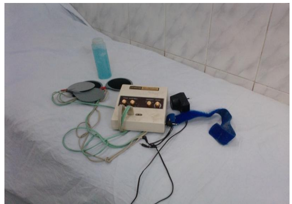
Fig (4) TENS apparatus Aerobic exercises

Transcutaneous electrical nerve stimulation Fig (4) was used to relief pain for sickle patients. It was applied for the patients in (PT) group during hospitalization period. The electrodes were placed over the most painful areas. The frequency was set on 100 Hz at a sensory level for 30 minutes, three times weekly for 8 weeks.