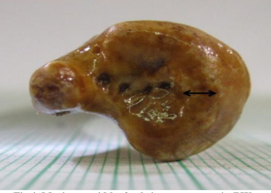
Fig 4: Maximum width of pole in transverse axis (PW).