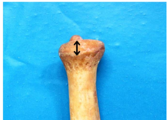
Fig 2: Maximum height of seat (SH).

Measurements were taken directly on the ulnae with the help of digital vernier calliper accurate up to 0.1mm.