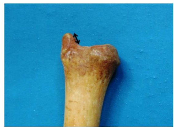
Fig 5: Length of styloid process (LS).