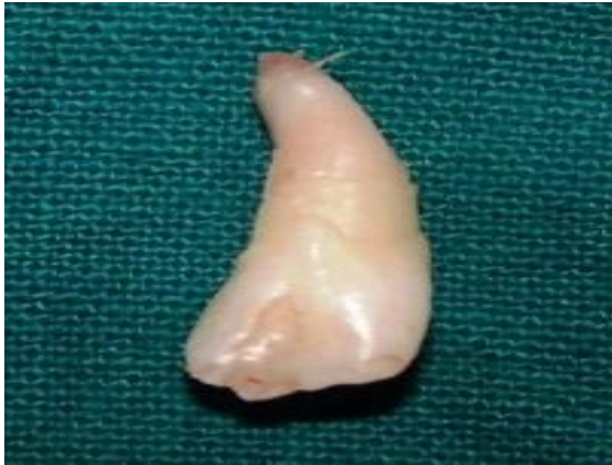
Figure 3 – Specimen of mesiodens after surgical extraction