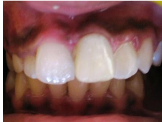
Figure 4 – Post-operative view with interim restoration of polycarbonate crown in 21