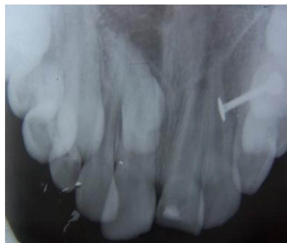
Figure 2 – Occlusal radiograph showing open apex in 21 and impacted mesiodens in relation to 11