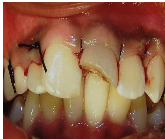
Figure 1 – Frontal view showing fractured 21 with discolouration

damage to the adjacent central incisor roots (Figure 3). Then the patient was recalled every three months for the follow-up of the apical barrier formation in 21. The patient returned only after 6 months for the check up but without any symptoms in 21. A radiograph was taken which revealed apical barrier formation without increase in root length or thickening of dentinal walls. Clinically this apical barrier was confirmed by using paper point and a K-file to check for any resistance or apical 'stop'. After the apical barrier was determined the tooth was obturated with tailor-made gutta-percha technique followed by an interim restoration (polycarbonate crown) to protect the tooth till the definitive treatment is given (Figure 4).