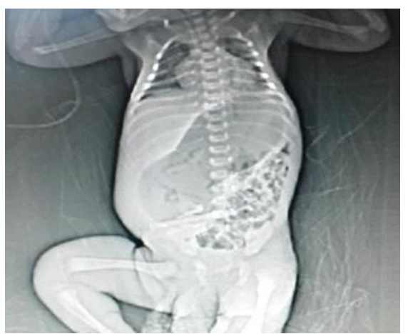
Figure 1 CT scan showing an intraperitoneal cyst

Presentation: A healthy baby at birth, delivered by normal vaginal delivery, weighing 2.9 kg, on twelfth day started showing distention of abdomen along with oliguria without defecation since two days. Clinical examination revealed prominent abdominal blood vessels and a large soft vague mass in abdomen. The infant was in distress but fully conscious.