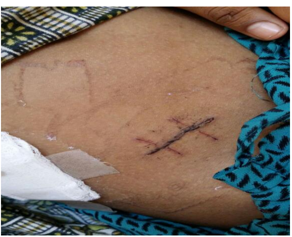
Figure 4 showing post operative photograph