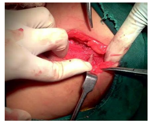
Figure 1 showing excision of intramuscular cysticercosis

The mass was surgically excised and a smaller pearly white cyst about 2 cm in size containing clear fluid was noted. Specimen was sent for HPE. HPE report- sections show multiple larval forms of cysticercosis cellulosae with features suggesting cysticercosis.