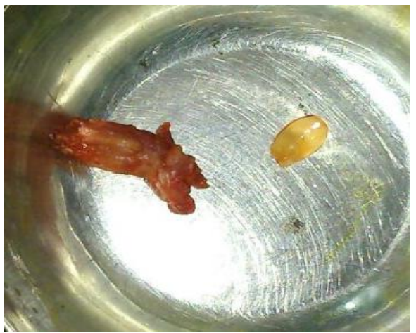
Figure 2 showing excised cyst.