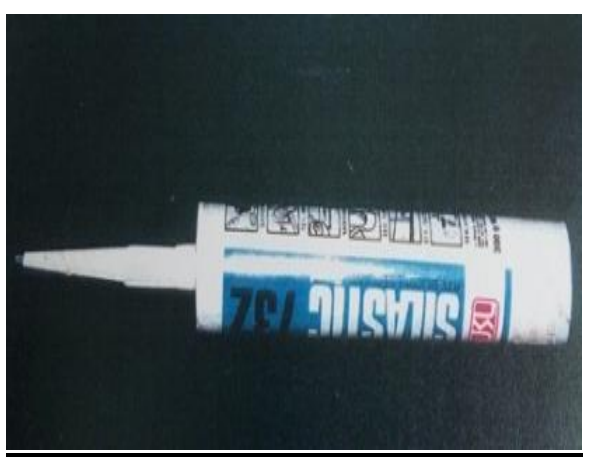
Fig.2 Industrial Grade silicone

30 hours the mould was opened and O-ring was removed for it and checked excess material trimmed. Ten samples were prepared for each material and total number 20 samples were prepared.