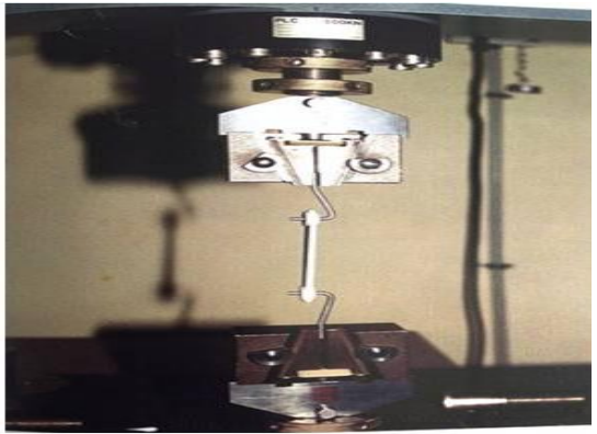
Fig:5 TENSILE STRENGTH TEST

Preparation of samples for tear strength: Impression of metal sheet dies having dimensions of 80mm length 30 mm width and 0.6mm thickness were made with the help of addition silicone. After curing the 20 samples were prepared. Preparation of Teflon wheels and metal shaft to engage the test samples for tensile strength. Teflon wheels of diameter 21mm and 10mm width (Fig4) were prepared by using commercially available pre-fabricated Teflon rods. A shaft having 60mm length Made up of cast metal is attached to the centre of Teflon wheel to act as axis.