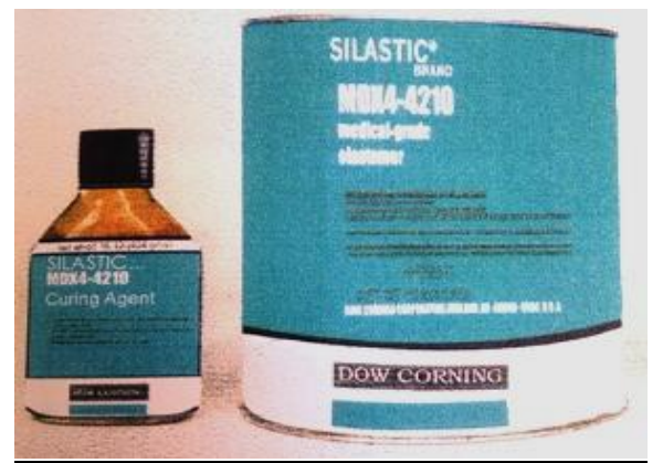
Fig.1 Medical Grade Silicone

Equipments used to test the physical properties: Lloyds Testing machine, calibrated scale, vacuum chamber.