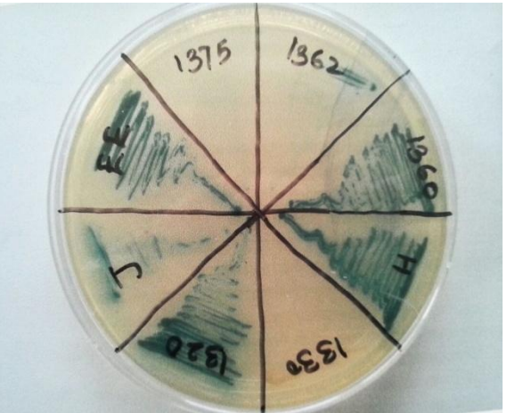
Fig 3: Blue colonies of MRSA on CHROMagar

CHROMagar (Hi-Media) is a novel and advanced chromogenic medium for the identification of MRSA. <sup>[6]</sup> For the identification of the MRSA among the isolates of S. HIMEDIA aureus. HiCromeMeReSa Agar Base (M1674) was used. S. aureus strains were inoculated onto the Hi Crome Me Re Sa agar and incubated at 35°C for 24 h. All cultures showing characteristic blue colored growth were taken as MRSA positive strains and the rest were reported to be MSSA strains. Fig. 3