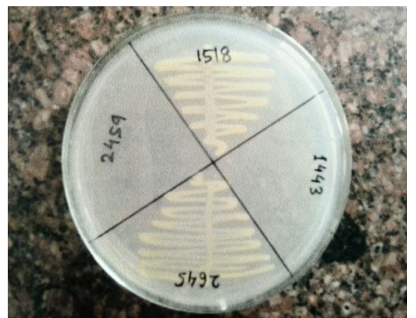
Fig.2: Growth of MRSA on Oxacillin screen agar.