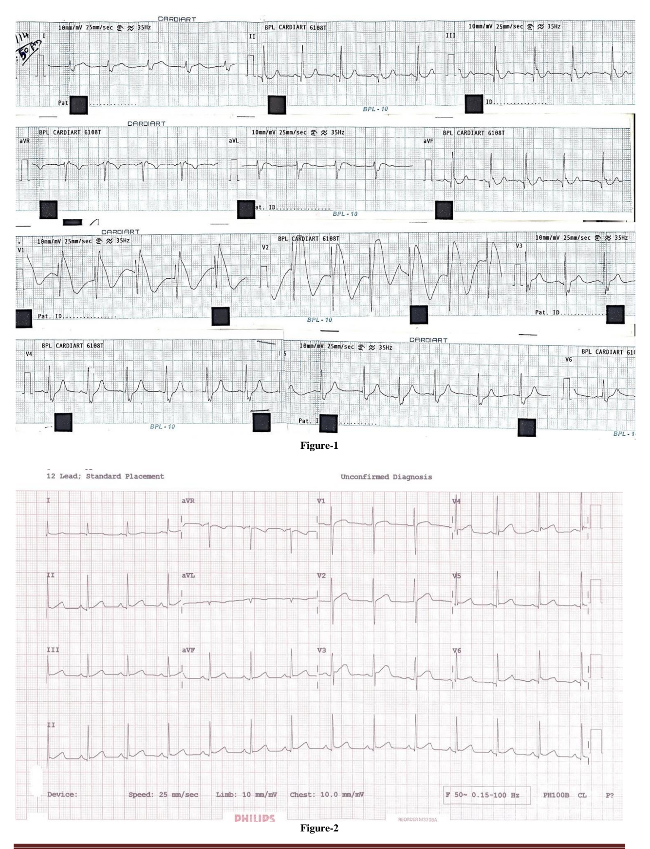
International Journal of Health Sciences & Research (www.ijhsr.org) Vol.5; Issue: 7; July 2015