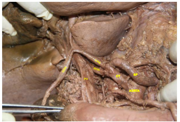
Figure 1: Shows CT - Celiac trunk with double hepatic arteries as LHA - Left Hepatic Artery, RHA-Right Hepatic Artery, GDA-Gastro duodenal Artery and PV-Portal vein

During a routine dissection of the region abdomen for teaching medical undergraduate students of a 70 year old male cadaver the following findings were noted. The variant structures around the liver were dissected carefully and photographed. Duplication of HA were found, originating from the CT individually, in addition to the usual LG and SP branches. There was no Common Hepatic Artery or else Hepatic Artery Proper found. The arteries were named as such, its distribution corresponding lobes of the liver as LHA and RHA. The LHA sprouts from the CT in between the layers of lesser omentum, course upwards to the free margin lying anterolateral to the PV and Common bile duct distributing to left lobe of the liver (Fig 1). In addition, LHA gives rise to a small stem of GDA above the first part of duodenum at a higher level. GDA divides into a SPDA, further run to the posterior surface of duodenum (Fig 2) and a SDA of Wilkie which courses anterior to the first part of duodenum, between the head of the pancreas and second part of duodenum (Fig 3).