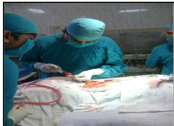
Figure 4: Infusion of BM MNCs at the site of lesion

The processed autologous bone marrow derived mononuclear cell concentrate (i.e. collected pellet) was used to infuse through the catheter very slowly at the rate of 1ml/minute approximately (Fig.4). As the infusion completed the catheter pulled out carefully.