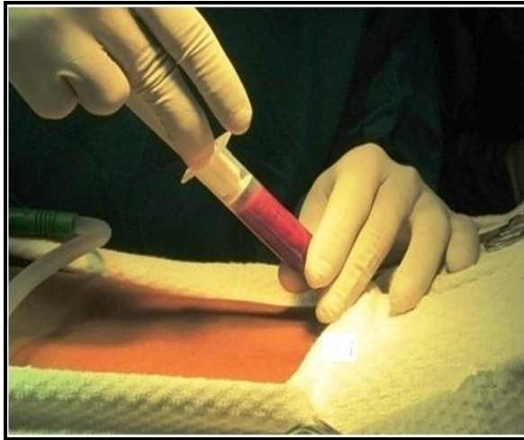
Figure 2: Aspiration of bone marrow from posterior iliac crest

In the group 2 and 4 the patient after general anesthesia was laid prone to