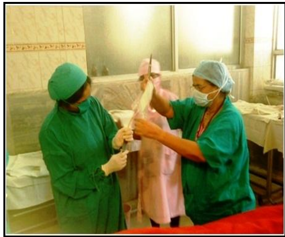
Figure 3: Collection of bone marrow in CPDA blood bag

aspirate 100-150 ml bone marrow from posterior iliac crest (Fig.2). The BM was collected in CPDA blood transfusion bag (Fig.3) followed by its processing using a self standardized differential protocol to isolate the BM MNCs within a totally aseptic condition.