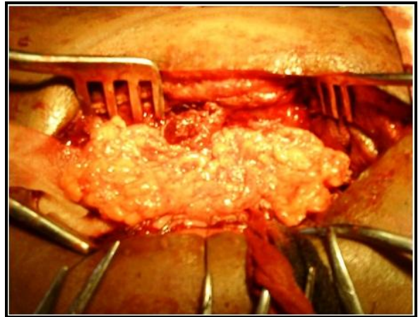
Figure 6: Transposition of omentum over the spinal cord at the site of lesion

Follow up: It was done at 6 weekly intervals for 1 year as per protocol and at each follow up patients were evaluated clinically and radiologically. The methodology (tools) to evaluate clinical endpoints for neurological recovery was AIS Scale. A data safety monitoring board ensured the ongoing safety of patients throughout the trial.