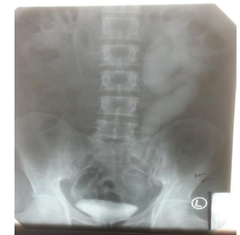
Figure 2: IVP showing left dilated ureter with left hydronephrosis and multiple left lower ureteric calculi.