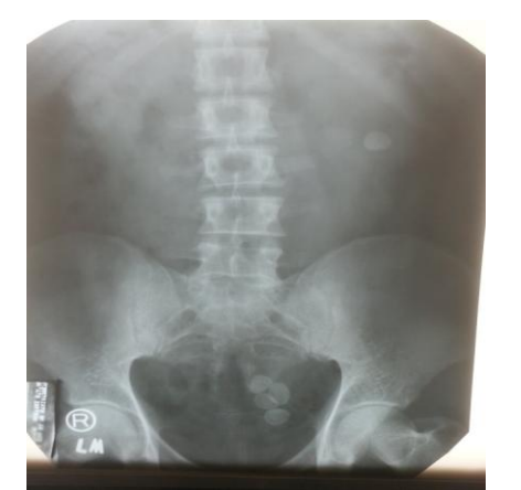
Figure 1: Plain radiograph of KUB region showing left lower ureteric calculi.

A forty year old male patient presented with recurrent attacks of left sided flank pain since 6 months, colicky type and radiating to the groin. He had no complaints of fever, haematuria or burning micturition. He was a known hypertensive on medication for the same. On examination, abdomen was soft and non-tender. Urine examination revealed 3-4 RBCs and 2-3 WBCs /hpf. An ultrasound of the abdomen revealed grossly dilated left ureter with 5 mobile calculi each of approximately 1.5 centimetre (cm) in size and left hydronephrosis. Plain radiograph of the abdomen revealed multiple calculi in the lower end of the left ureter (Figure 1). Intravenous pyelography (IVP) study demonstrated dilated left ureter abruptly ending just proximal to the ureterovesical junction with 5 mobile calculi and a hydronephrotic left kidney (Figure 2). Patient was posted for surgery and a reduction left ureteroplasty with removal of the calculi and re-implantation of the ureter by Politano-Leadbettter technique with left sided DJ stenting was done. Postoperative period was uneventful and the patient was discharged in 7 days. An IVP done 9 months postoperatively revealed a normal sized left ureter with no calculi, mild residual left hydronephrosis and no reflux on straining (Figure 3).