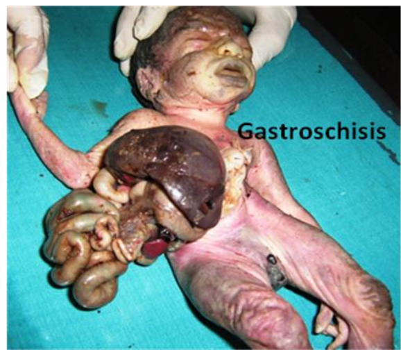
Fig 1: Right sided Gastroschisis.

The defect is paraumbilical with evisceration of stomach, liver, gall bladder, small bowel loops, large bowel loops which were normal, no membranous covering, no cardiac and urogenital involvement but associated with kyphosis and scoliosis towards right side with congenital talipes equino varus (CTEV) on left side. (Fig 1, 2).