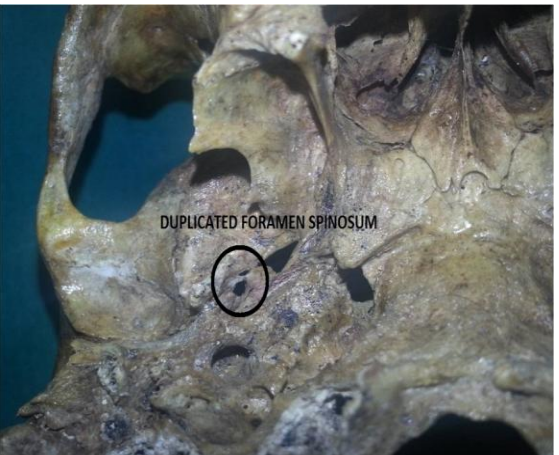
Fig.6: Showing duplicated foramen spinosum