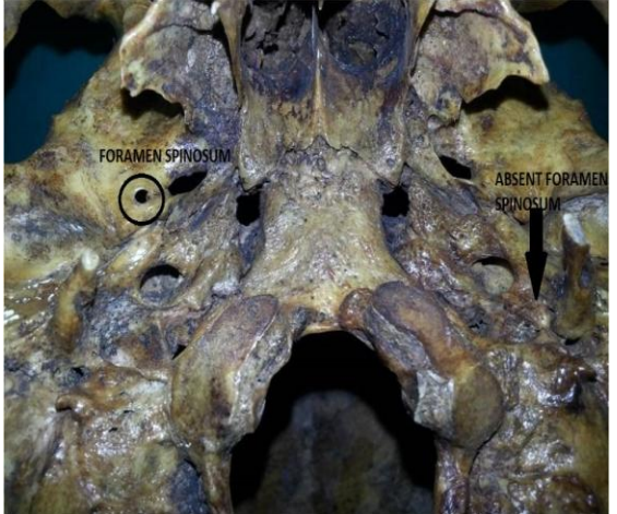
Fig.5: Showing absent foramen spinosum

(3.75%) one on the right side and two on the left side (Fig.6).