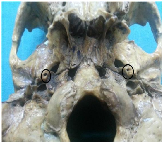
Fig.1: Showing round type of foramen spinosum

The incidence of types of foramen spinosum has been shown in Table 1. The most frequent type observed was round shape (52.5%) [Fig.1] followed by oval (30%) [Fig.2], irregular (10%) [Fig.3] and pin-hole