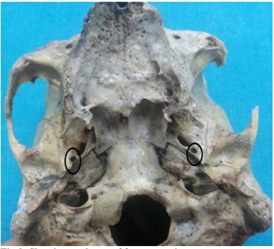
Fig.2: Showing oval type of foramen spinosum

(2.5%) [Fig.4]. Foramen spinosum was round in shape on both sides in 15 skulls (18.75%) and oval in shape on both sides in 9 skulls (11.25%).