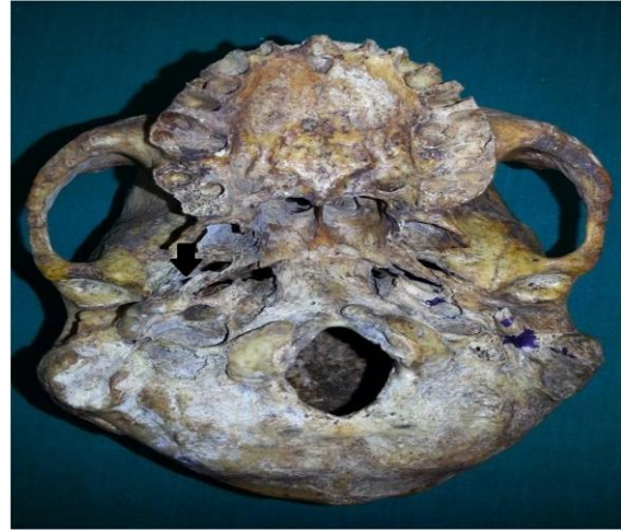
Fig.4: Showing pin-hole type of foramen spinosum