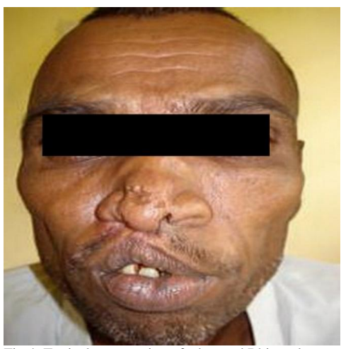
Fig.4: Typical presentation of advanced Rhinoscleroma

all the patients have recovered completely giving a 100% results with Ciprofloxacin Rifampacin or Rifampicin Doxycycline. No recurrence was seen. Rests of the 6 patients are still continuing the treatment till date. This is in par with the other studies and case reports to be an effective and affordable option. [11-13] Out of the 6 patients who underwent surgery, 4 have completed treatment with removal of polythene tubes and none of the patients have recurrences and is comparable to a case report by Vadher DJ. [14] Two of our patients are still continuing the treatment. Only 1 case of recurrent Rhinoscleroma was seen, who underwent surgery twice in duration of 20 years and has been operated (recanalization) again and is on treatment. Out of the 2 cases of laryngeal scleroma one operated for stridor (emergency tracheostomy) during the follow up period.