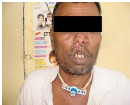
Fig. 2: Patient with laryngeal rhinoscleroma who underwent tracheostomy for narrowed upper airway

OD) for a period of 6-12 weeks according to their clinical cure. It was assessed by improvement in symptoms and regression of granulomatous masses.