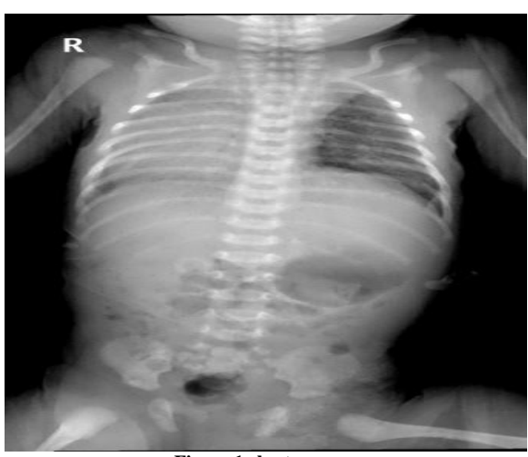
Figure 1 chest x ray

Echocardiography revealed situs ambiguous, dextrocardia, IVC connected to large common atrium, Right atrial isomerism, only one coronary sinus seen. Pulmonary veins connected to large common ambiguous atrium and 2 small muscular VSD, large perimembranous VSD, single common AV valve with pulmonary hypertension, right ventricle larger than left and both vessels arising from right ventricle with transposition of great vessels. No aortic stenosis or pulmonary stenosis, pulmonary valve larger than aortic valve, ascending aorta and proximal aortic arch normal, distal arch and preductal descending aorta narrowed. PDA moderate size with left to right shunt. Normal coronaries postductal descending aorta.