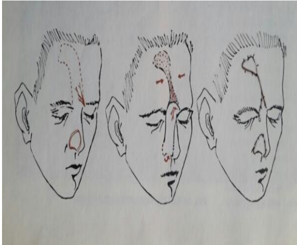
Figure- 1: Reconstruction of Nose by flap from forehead

performed in three stages. First stage-Adequate mobilization of lip lateral to cleft, Second stage- margins are made raw by cutting the whole thickness of lip and in Third stage skin flaps are sutured in such a manner that continuity red margin of lip is properly maintained. A rubber tube of proper size is introduced through nostril first and then repair is started. <sup>[23]</sup> (Figure-2)