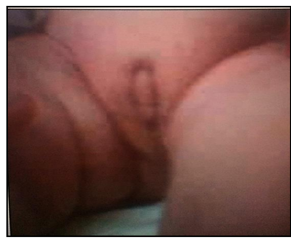
Figure 2: A newborn baby girl with (46XX DSD), she had clitoral enlargement.