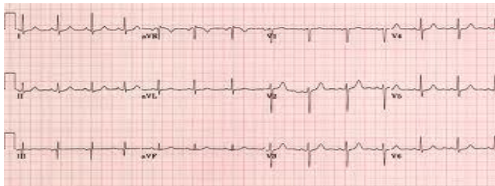
FIGURE 3: Normal ECG

Medicine consultation was done to rule out other systemic involvement. ECG was taken which did not show any conduction defects.