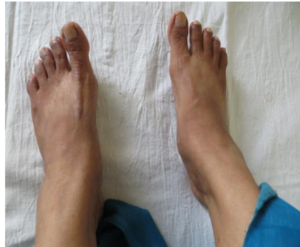
Fig 1. Clinical picture showing right navicular bump.

encouraging with 94 percent improvement in pain profile on seventh day. The pain relief was associated with improved gait and walking distance parameters. The patient was painfree and showed no fresh complaints as reviewed after twelve weeks, three and six months post- procedure. She was well explained of the future course and complications of the disease and regular periodic followup for future management of the disease.