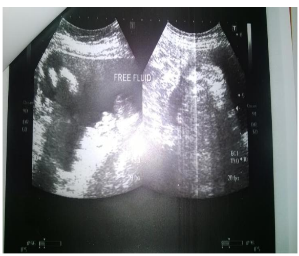
Figure 2 USG Abdomen with free fluid in peritoneal cavity.

Hemogram was within normal limits, Xray abdomen standing was inconclusive without air fluid levels or gas under diaphragm [fig1]. Ultrasonography abdomen showed free fluid in abdomen with dilated bowel loops [fig2]. CT abdomen showed similar findings.