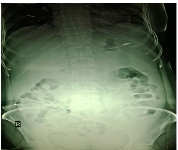
Figure 1 X ray Abdomen erect showing dilated bowel loops.

A 60 year old female presented with pain in abdomen and distention since 8 days, which was associated with suabacute intestinal obstruction. There was no history of per rectal bleed, weight loss, fever, gynecological complaints or previous operation.