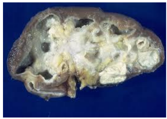
Figure 1. Specimen.

Patient was managed by AKT followed by Right NephroUreterectomy.