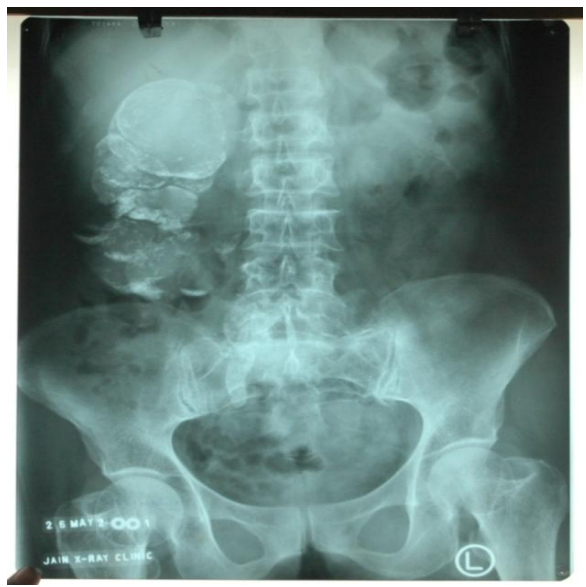
Figure 2. CT IVU.

urinary tuberculosis Today, infrequent and renal calcification is not uncommon. but associated ureteral are rare. [1] IVU has calcifications traditionally been the gold standard tool to diagnose and evaluate urinary tuberculosis, but CT is the most sensitive method of identifying renal/ureteral calcification. [1] In our case, owing to extensive disease, the calcification was clearly visible on the CT IVU. Calcification in the ureteral wall may