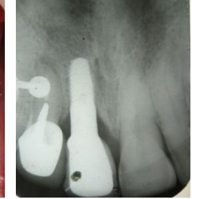
Fig. 10 showing IOPA of implant to