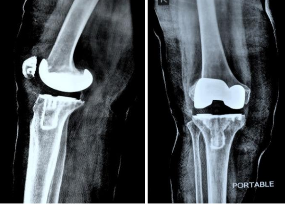
Fig. 1b. 10 week Cast Application

patient was given immediate cast due to minimal displacement and swelling. All patients were evaluated at the end of 1 week for plaster condition as well as radiological alignment. The cast was continued for an average period of 10-12 weeks.