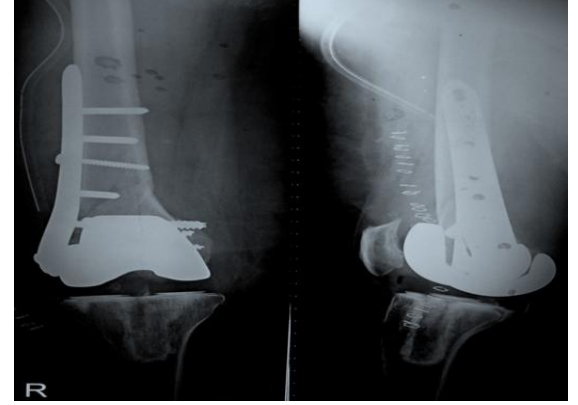
Fig. 2b. Immediate Post-Operative.