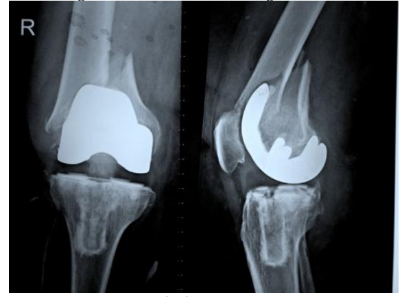
Fig. 2a. Fracture