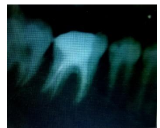
Fig 2C (Post obturation)

interpretation of particular marks or characteristics, such as an unclear view or outline of the distal root contour or the root canal, can indicate the presence of a 'hidden' RE. To reveal the RE, a second radiograph should be taken from a more mesial or distal angle (30 degrees).<sup>(12)</sup>