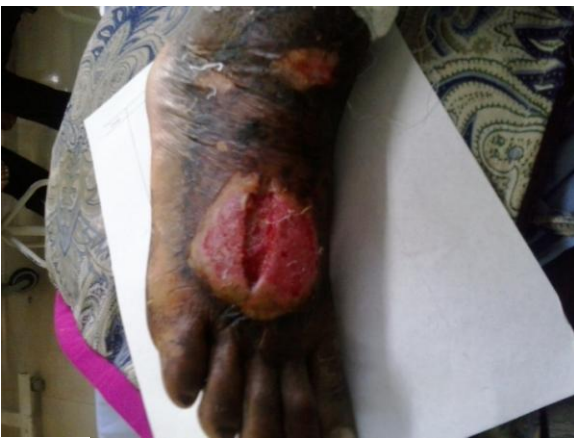
Figure 1 (Fasciotomy for the cellulitis (caused by viperine snake bite) of the right foot)

He was brought to the hospital with breathlessness, altered sensorium and gross cellulitic changes over right foot .On examination, the patient was drowsy, tachypneic, localizing painful stimuli, talking irrelevantly (Glasgow Coma Scale 8). Ophthalmoscopic findings were normal. His pulse rate was 110 per minute, blood pressure was 126/68 mm of Hg. He was intubated and kept on ventilatory support.