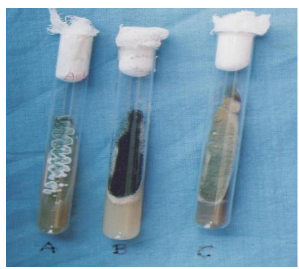
Figure 1: Showing the Culture of Aspergillus on Sabouraud's dextrose agar.

of SDA were observed every alternate day for appearance of growth up to 20 days before release as negative [Figure:1]. The growth was identified by standard procedures <sup>[5]</sup> as the identification of isolates was done by macroscopic examination of culture tubes; the characteristics considered in fungal identification were texture, color and growth rate. The slide culture technique with Lactophenol cotton blue (LPCB) shows characteristics such as mycelium, conidia types and hyphae more clear [Figure:2].