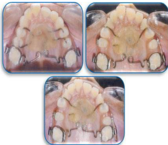
Fig.5 : showing bone anchored molar distalization appliance in place.

Treatment commenced with MBT versatile appliance in 0.022 inch slot. Pendulum appliance (implant supported) was fabricated and placed in the oral cavity for molar distalization as described above. Pendulum appliance was activated and molar distalization was done. A Class I molar relationship was achieved in 6 months. The maxillary first molars distalize at an average of 4 mm tipping distally, the maxillary second premolar and first premolar retracted distally (Fig.5).