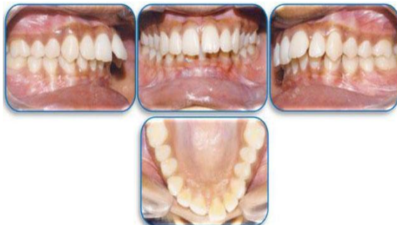
Fig.2: Pre-treatment Intra – Oral features.