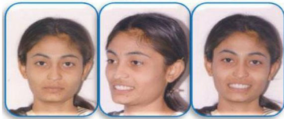
Fig.6a : Post treatment Extra Oral Features.