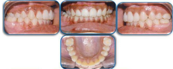
Fig.6a : Post treatment Intra Oral Features.