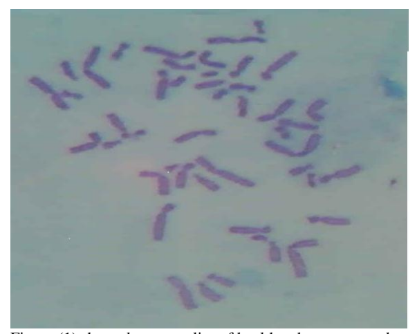
Figure (1) shows better quality of healthy chromosomes by using 0.33% NaCl