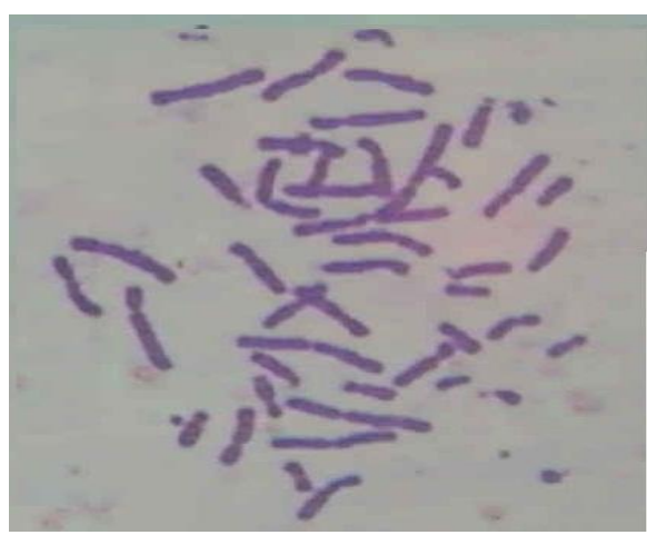
Figure:3 shows good quality of healthy chromosomes by using ohnuki solution. The result of the present study shows that better quality of healthy chromosomes can be obtained by using 0.33% NaCl which can be used for further cytogenetic study.