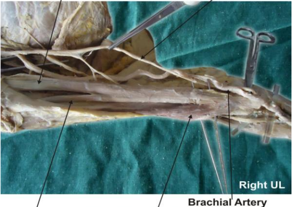
/ Brachial Artery Supernumerary Head of Biceps Brachii Long Head of Biceps Brachii

Figure 1: The photographic presentation of the third head of biceps brachii taking origin from the anterolateral surface of the shaft of the humerus. The third head joined with the other two heads and form a common tendon which got inserted into the radial tuberosity of the radius and bicipital aponeurosis.