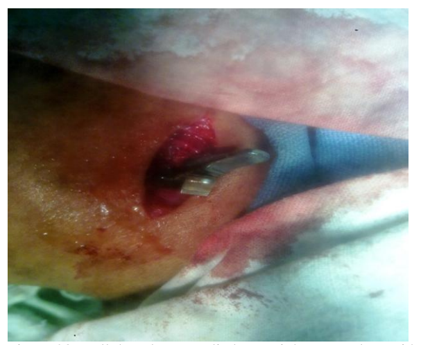
Figure 03: Bull dog clamp applied over right external carotid artery