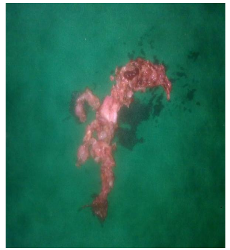
Figure 05: Portion of excised AVM nidus

Neck vessels and circle of Willis appeared normal in caliber. Brain parenchyma and ventricles did not reveal any significant abnormality.