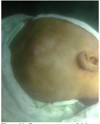
Figure 01: Gross appearance of right parieto-temporo-occipital AVM

cardiovascular system was essentially within normal limits. Fundoscopy showed no abnormality. Hematological and biochemical parameters were also normal. Chest X ray, ECG showed no abnormality.